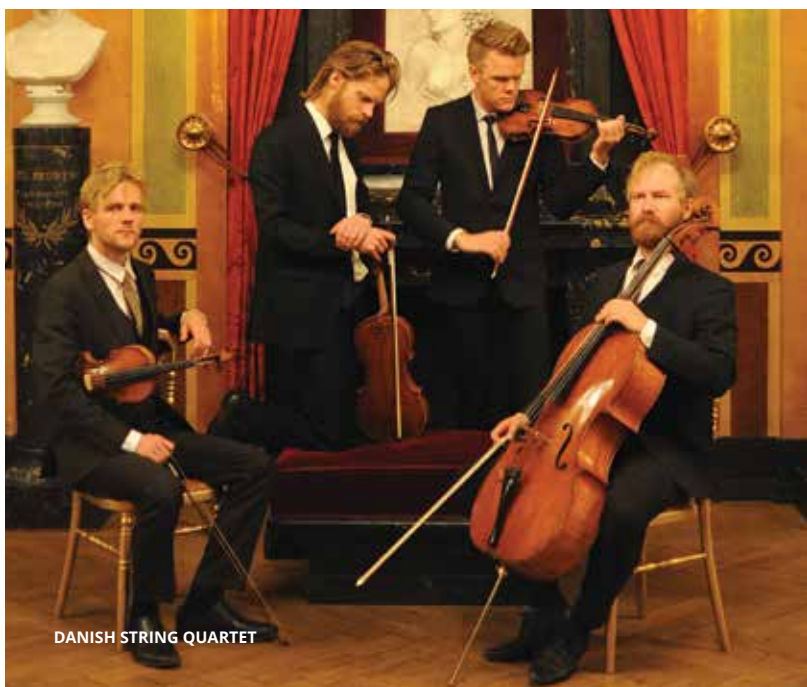
DANISH STRING QUARTET